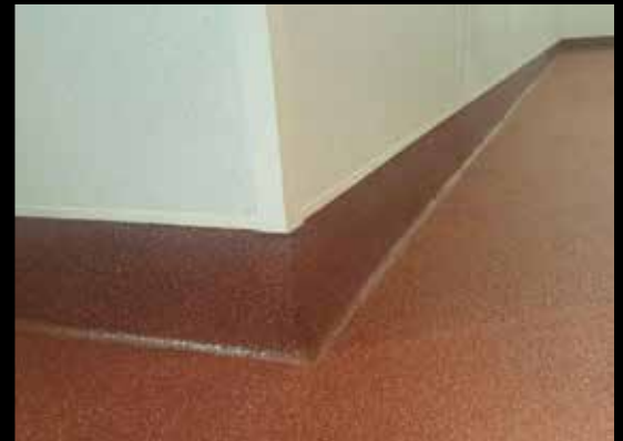
Integral 4" or 6" cove base creates a bathtub effect for effective waterproofing.

Contact us to find your local Regional Manager and customize a system that's right for you.