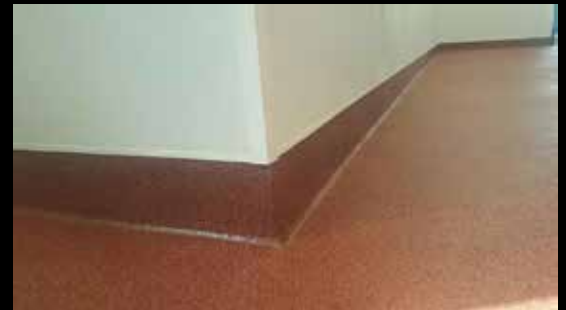
Integrated 4" or 6" Cove Base.

Contact us at sales@res-tek.net to find your local Regional Manager and customize a system that's right for you.