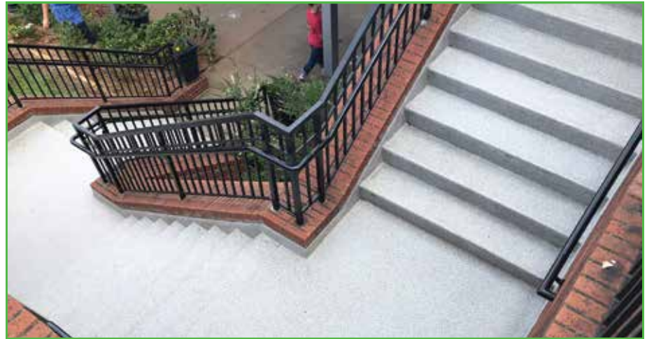
Stairs and walkways require slip-resistant surfaces for safety