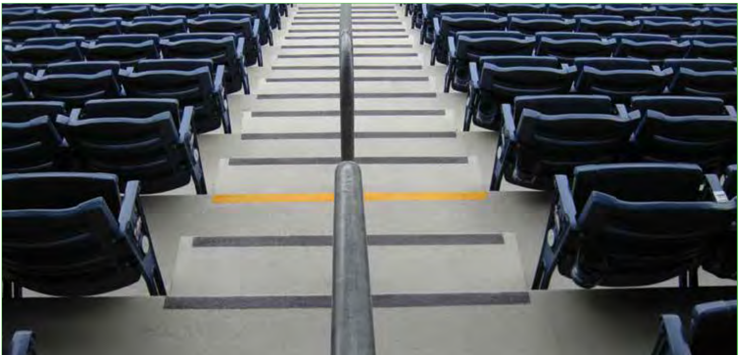
Seating areas benefit from both stain and slip-resistant surfaces