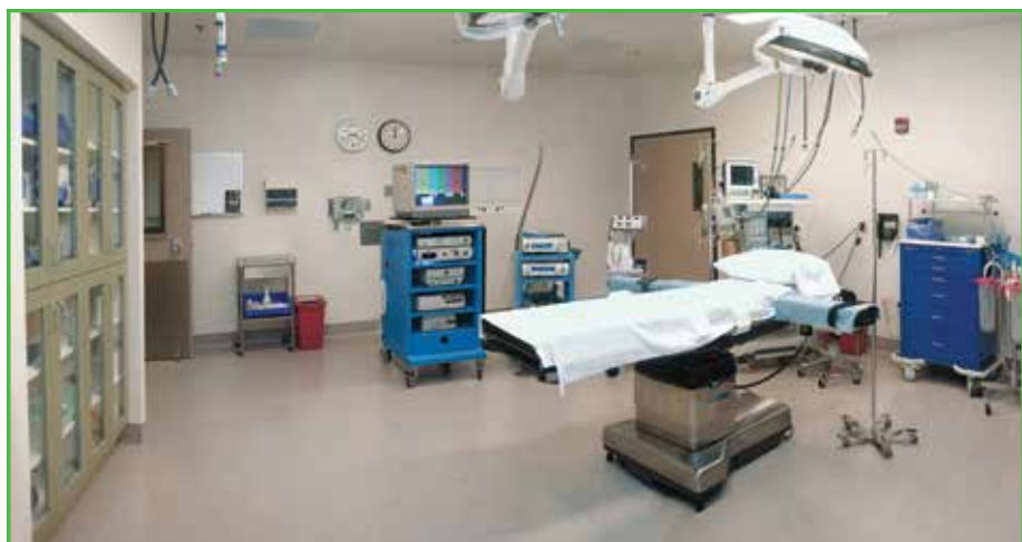
Non-porous, Stain-resistant, Easily cleanable, Slip-resistant.

Res-Tek is a leading US manufacturer dedicated to the formulation and production of resin-based acrylic flooring systems, cementitious urethane, epoxies, and polyaspartics. Our products are made in our facility in Georgia, not overseas, eliminating long lead times and keeping your project on schedule. Our products perform consistently and have been chosen by industry leaders throughout North America.