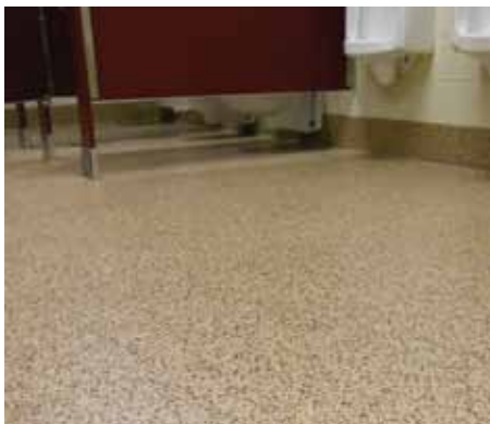
Restrooms & Locker Rooms

RT-05 Polymer Concrete – Polymer concrete is used for resurfacing, pitching and sloping, as well as full-depth repairs prior to the installation of a MAC-Guard™ floor. The system can be used for shallow and medium depth patches, under layment, grouting, and small repair. It provides a fast, permanent repair that yields exceptional strength and durability.