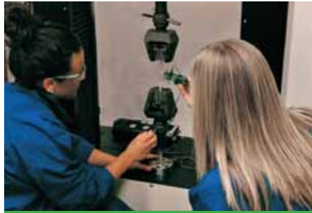
Research & Development Program