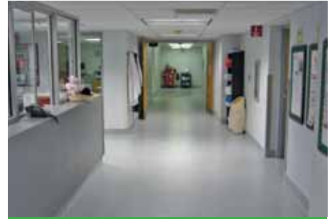
Durable, Quality Flooring Solutions