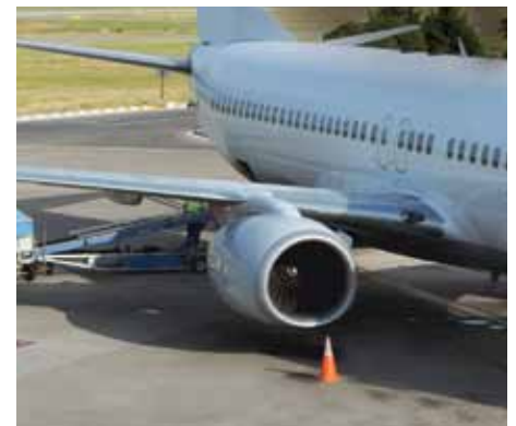
Airport Runways, Hangars, & Concourses