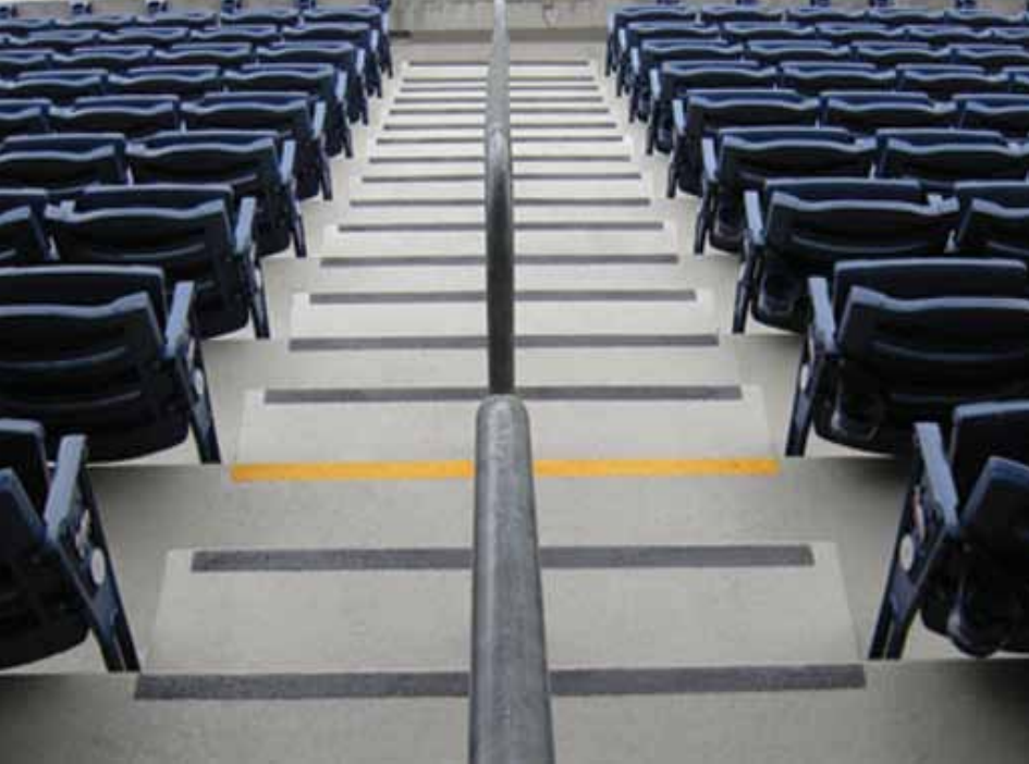
Res-Tek is the Leading North American Supplier of MMA-Based Acrylic Flooring Systems.

For more than 50 years, acrylic flooring systems have been used in a wide variety of applications around the world. Res-Tek offers this dynamic market unsurpassed experience and dedication in delivering unique flooring products designed for even the most challenging environments. Our in-house technical team can custom fit our full range of MAC-Guard™ methyl-methacrylate (MMA) based acrylic products to address each individual customer need. At Res-Tek, the only thing that's more important than our flooring is the satisfaction of our customers.