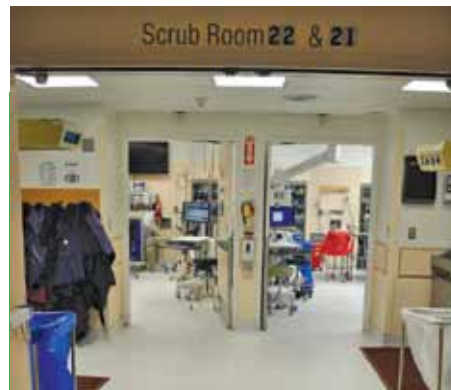
Hospitals & Laboratories